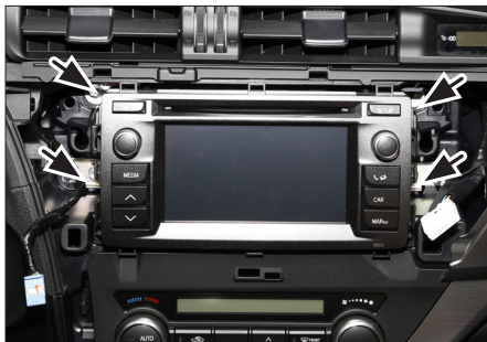
4. Remove 4 screws of OEM head unit

Unplug hazard light switch and Passenger Airbag switch carefully