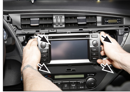
5. Remove OEM head unit by pulling it towards your direction (see arrows)