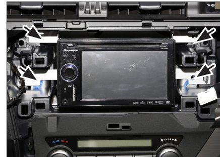
7. Connect all required circuit points place Double DIN head unit and fix it with 4 screws (see arrows)