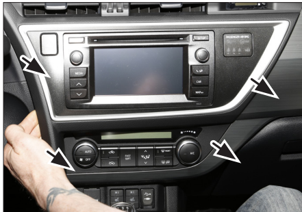
3. Remove panel by pulling it towards your direction (see arrows)

Unplug hazard light switch and Passenger Airbag switch carefully