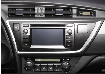
1. Toyota Auris OEM dash board