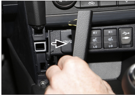
2. Remove plastic clips at left and right side beside climate control unit