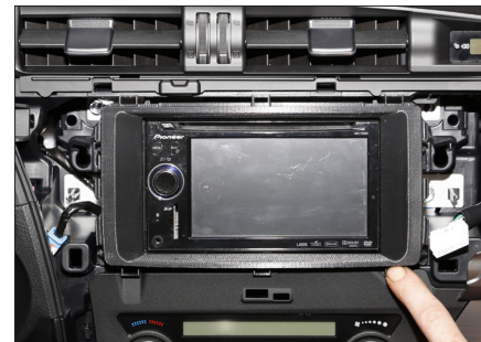
8. Place facia plate over Double DIN head unit